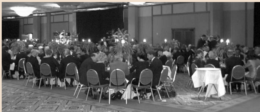
The Foundation's 2003 Gala, in the elegant setting of Kansas City's Westin Crown Center Hotel, featured another sell-out crowd.

Since 1996, one of the most anticipated events in Eastern Jackson County each year is the Foundation's Toast to Our Towns Gala. The 2003 affair – themed "Heartland Roots: Heartland Stars" to highlight the tradition of caring that runs deep in the communities of Eastern Jackson County – again exceeded expectations.