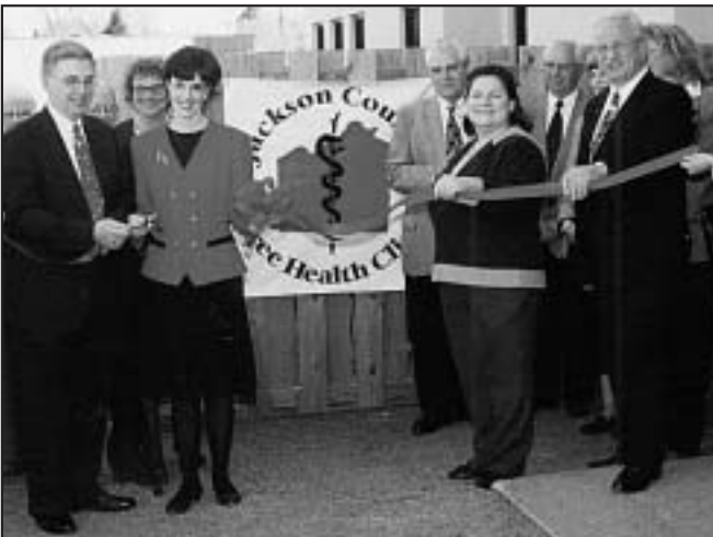
The Jackson County Free Health Clinic opened in April of 2000 as an all volunteer program serving the medically uninsured of Eastern Jackson County. The Foundation provided initial start up funding that has been matched by private donations.